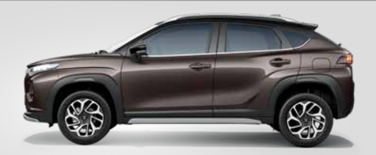
EARTHEN BROWN + BLUISH BLACK