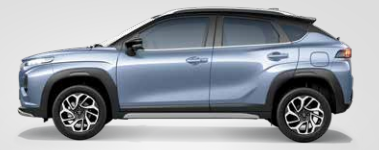
SPLENDID SILVER + BLUISH BLACK