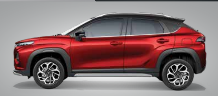
OPULENT RED + BLUISH BLACK